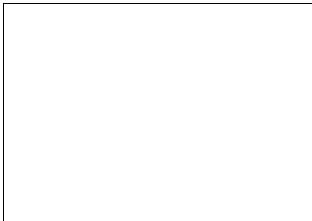
FIGURE 2. Transhiatal view demonstrating the leiomyoma after splitting the esophageal muscles.

The integrity of the esophageal mucosa was checked by injecting air into the esophagus. There was no air leakage.